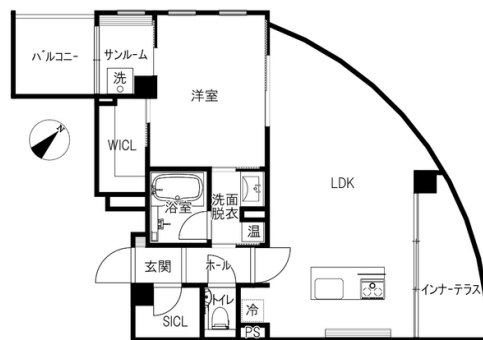
Room layout 洋7 LDK16.4 (専有面積: 62.79㎡)